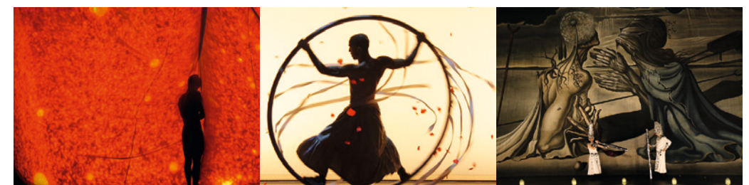
LA VERITÀ